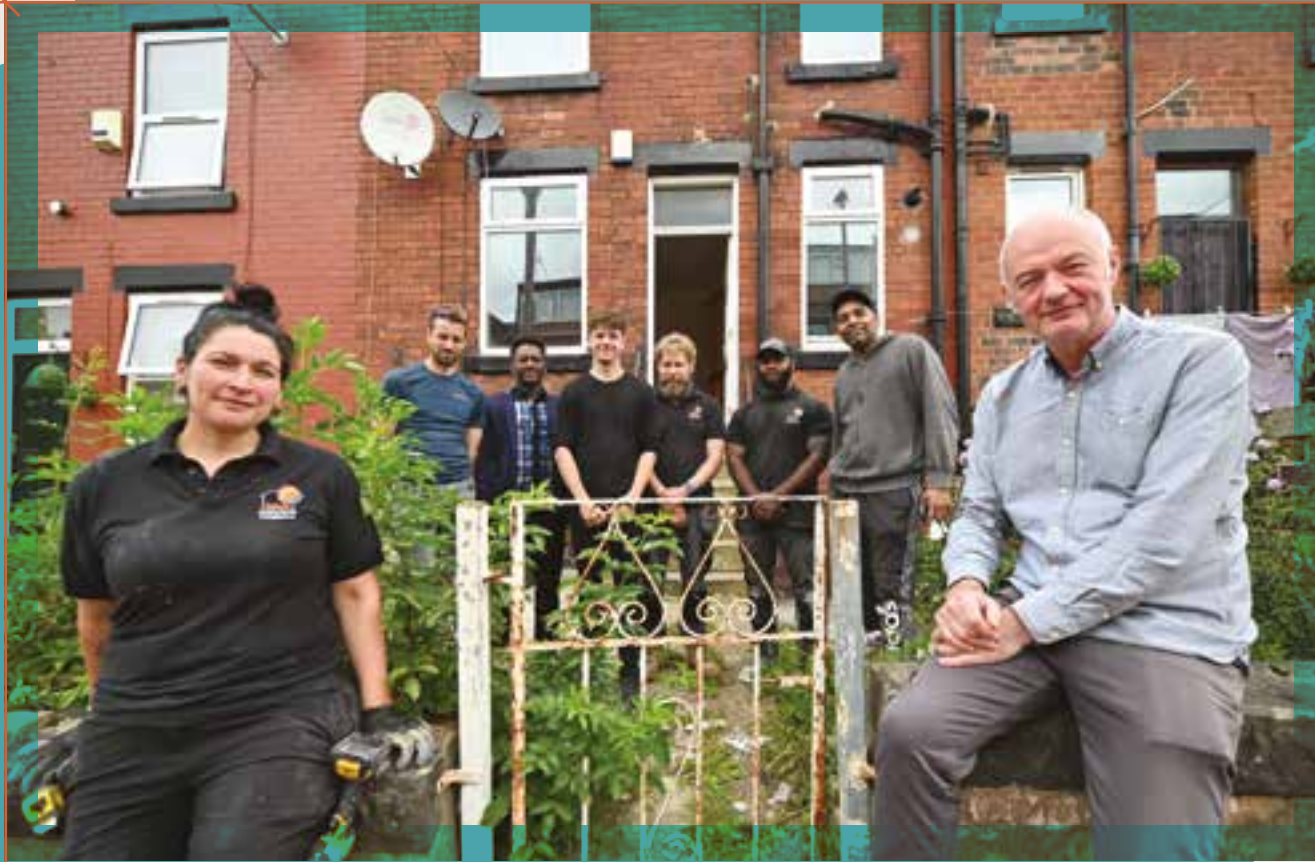
The launch of our Community Share Issue at our Conway Terrace property