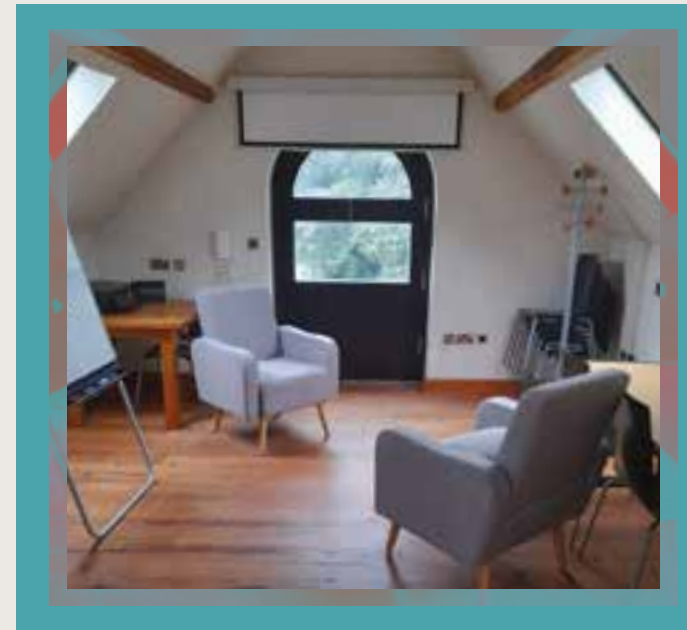
The Coach House interior

We are looking forward to welcoming our 134 new members and investors to Latch and hopefully building a long term relationship with them. We aim to purchase the properties in the Autumn and to let the homes to new tenants in early 2022.